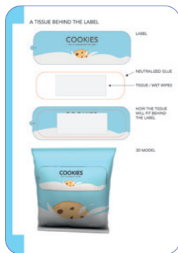
Smart Labels Lucas DeBock, Belgium