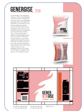
Bjarne Castelein, Belgium